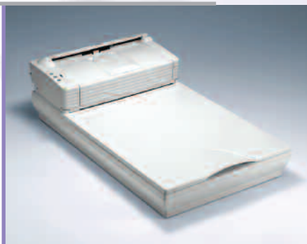
DR-2580C with Optional Flatbed Scanner

The DR-2580C scanner is not only one of the smallest and most versatile in its class, but also incredibly easy to use. For one-touch operation, simply assign your most common functions to its customizable Scan-To-Job buttons. You'll be able to enhance black-and-white scans with the Contrast Adjustment feature that sharpens images and makes text more distinctive on low-contrast documents. And you'll consistently capture high-quality images thanks to 3-Dimensional Color Correction technology, and a built-in shading board automatically adjusts shading prior to each and every scan job.