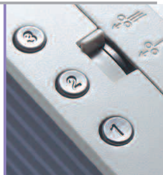
Scan-To-Job Buttons for One-Touch Operation