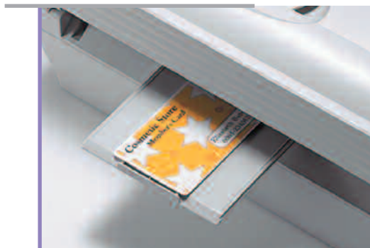
Straight Path for Card Scanning

Compact, powerful, and fast. The Canon DR-2580C color scanner is designed to meet the diverse imaging needs of your busy office. This innovative device offers you the most advanced features in document scanning. Boasting record speeds for scanning and saving to searchable PDF has earned the DR-2580C scanner PC Magazine's Editors' Choice award. Not surprising since it's from Canon, the brand the world relies on for the latest solutions in imaging technology.